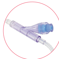
Needleless Access Site